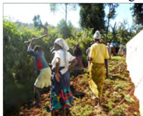
Beneficiaries working around the greenhouse.

The leadership teams comprising those that were trained on the Greenhouse care, and the local subcommittee in charge of the Project together with the guardians and children, were all seen actively involved in different ways respectively. The leaders and guardians had grouped themselves into working shifts.