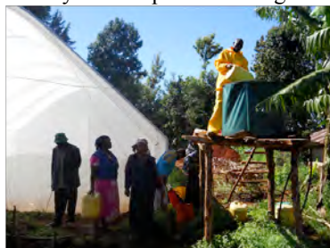
Beneficiaries fetching water.

The guardians cannot believe that they are seeing very healthy tomato plants in the greenhouse. This is because