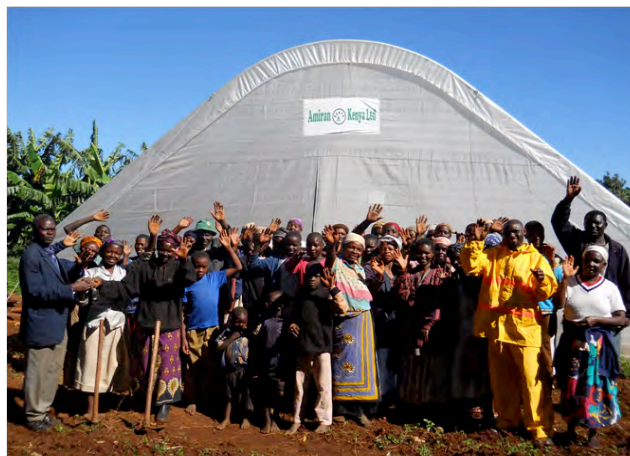
Beneficiaries in Manga.