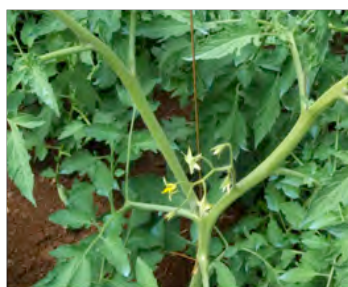
Tomatoes at flowering time.

It is their commitment and hard work that continues to inspire and urge us (HEART) to be excited about this partnership. These guardians, majority of them elderly have demonstrated that given a little empowerment, they will go the extra mile in making sure there is a difference in their lives and that of their children. This is an example of teaching someone how to fish rather than giving them a fish. Other members of the community caring for orphaned children cannot wait for their turn to have their greenhouses that will provide them food security.