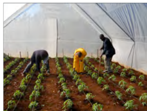
Tomatoes two weeks after transplanting.

One of the challenges identified (this will be true for all the districts) is a continued supply of water. HEART had given this requirement to the communities for installation of greenhouse. The community came up with a solution of addressing this need by digging a borehole which they embarked on manually (literally hand dug). “The greenhouse is a double blessing for it has made us dig a borehole which upon completion will serve our household needs as well. Even though it is taking as a while to reach the water-bed we are certain we will get it”, said one of the smiling guardians as he pointed at the drips of water already beginning to sip in at the bottom of the hole. They have so far dug fifty feet using hoes, shovels and buckets.