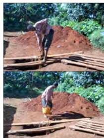
Digging of the borehole.

the climatic conditions of this area are not conducive for tomato farming but the greenhouse has provided the right environment for them to grow!