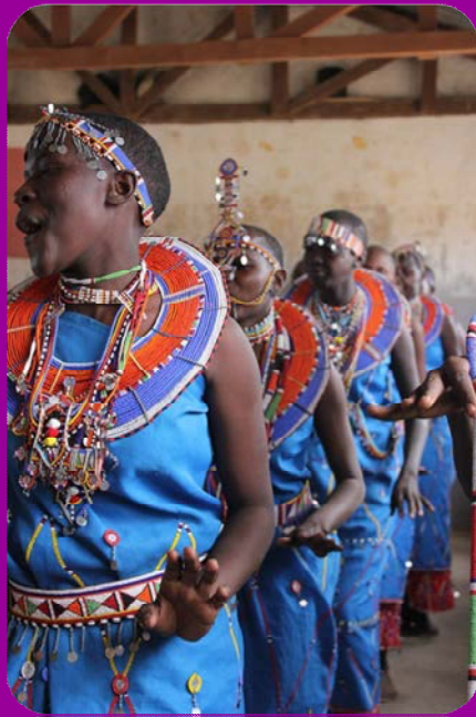
Above: Girls happily singing at a FFG event in Oldonyonyoki, Kajiado.

We continue to thank all our partners for supporting the girls in the project.