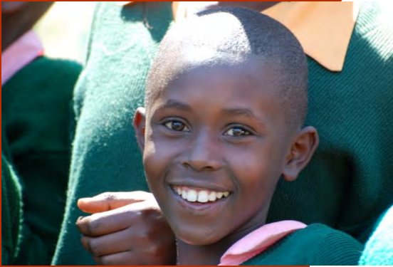
A school girl smiling in appreciation of the year supply of sanitary towels and undergarments !