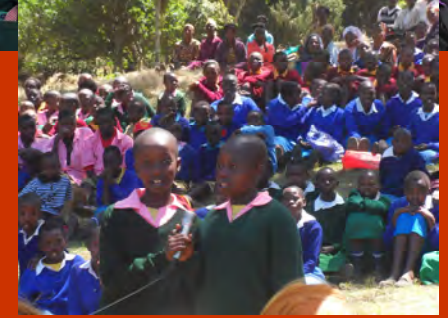
Photos: Left, Pack showing the 8 pcs packets for the sanitary towels. Right, Beneficiaries during different distribution days.