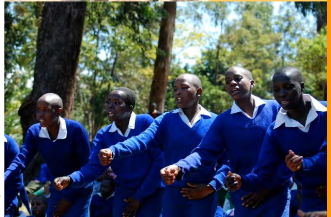
Girls perform during the distribution event in Meru.