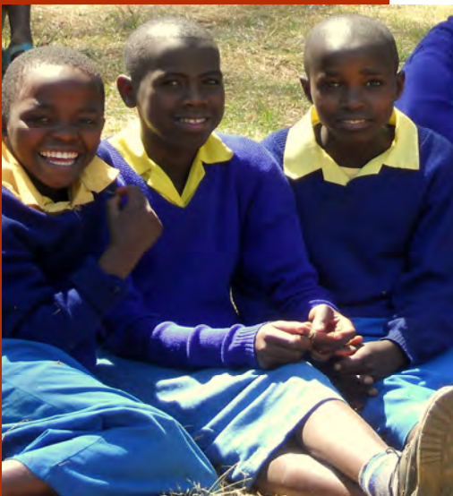
Girls happily sit during the health education session in Meru.